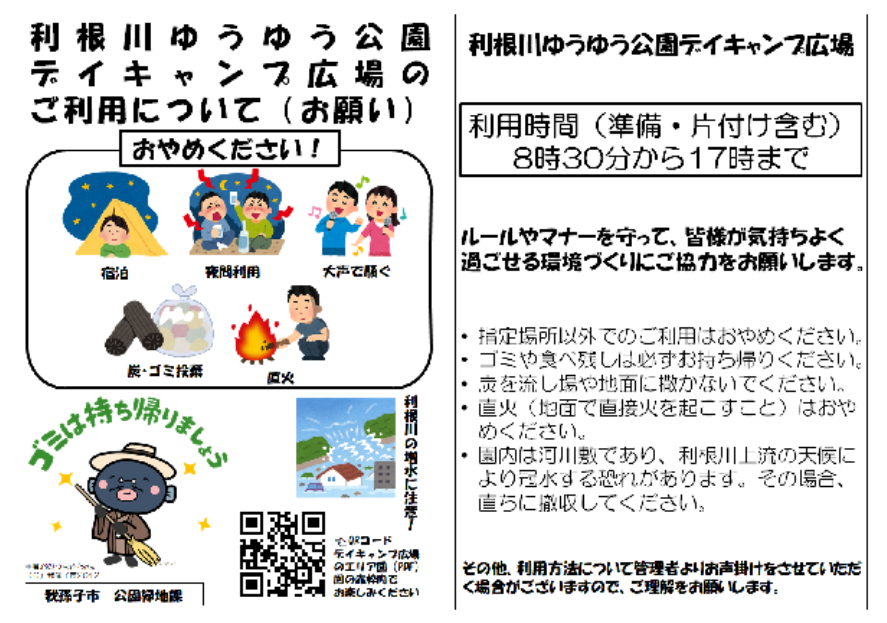
Rise enlightenment handbill of manners

A staff is distributing a rise enlightenment handbill of manners to everybody using a square as the part, so please take care of cooperation.