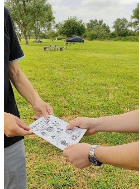
The state of the enlightenment handbill distribution